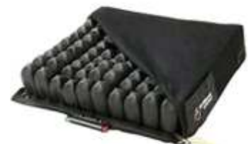
Air Pressure Care Cushion