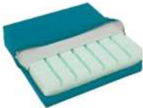
Memory Foam Pressure Care Cushion

The size of the cushion will be determined by the size of your wheelchair and is manufactured according to your specific measurements. Each cushion is issued with a cushion cover (waterproof / standard)