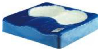
Gel Pressure Care Cushion