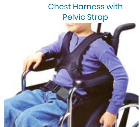
Chest Harness with Pelvic Strap